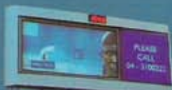
6m x 3m