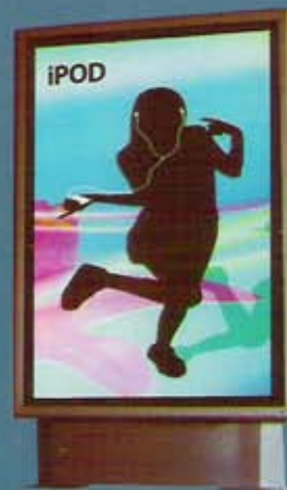
Regular - 1.2m x 1.8m