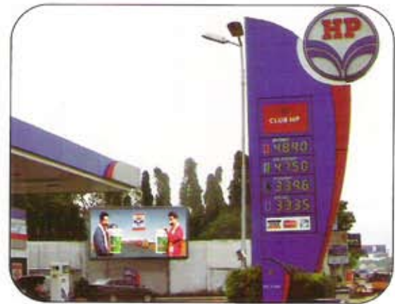
6m x 3m