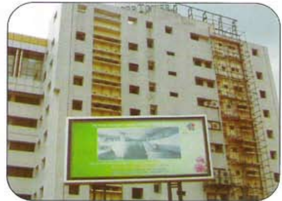
3m x 1.5m