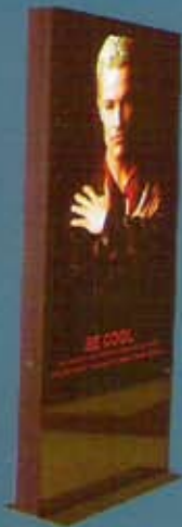
Slim - 1.2m x 1.8m